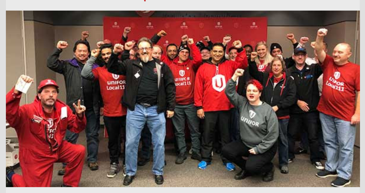
An 11<sup>th</sup> hour tentative agreement ends a 26-day strike action by nearly 5,000 Unifor Local 111 and 2200 transit members in Greater Vancouver, narrowly avoiding a system-wide shut down.